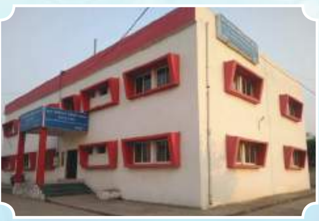
RSETI BURHANPUR BUILDING