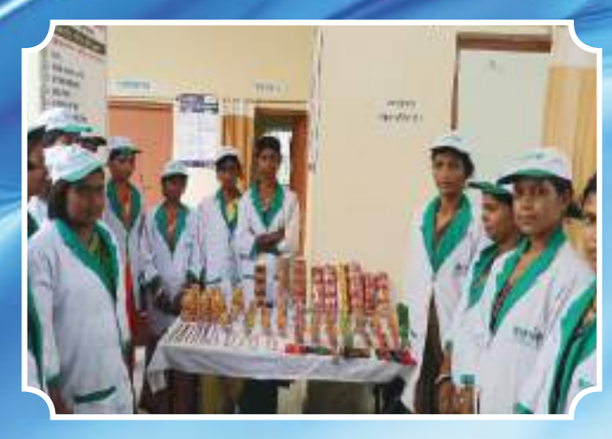
Practical Session of Costume Jewellery training at RSEII Koderma