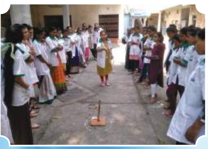
Ring Toss play among trainees at RSETI Wardha