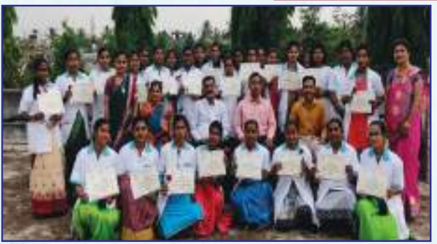
Valediction Program Conducted in the Presence of Shri. Mahesh Harne at RSETI Sangli