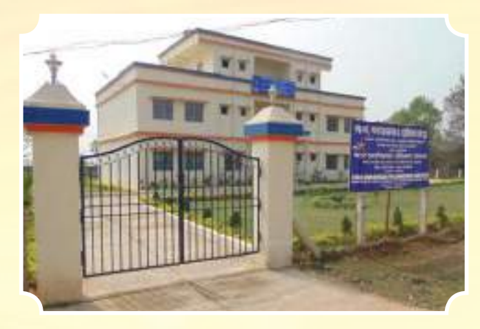
RSETI BARIPADA BUILDING