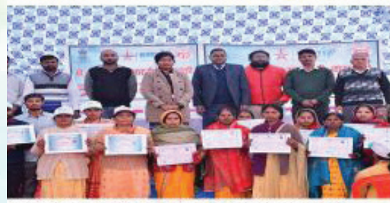
ication Program Conducted at RSETI Barabanki