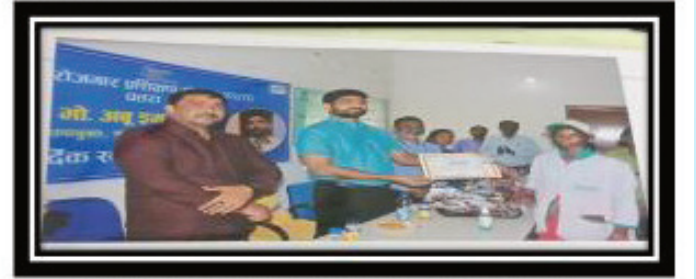
Certification Program Conducted at RSETI Chatra